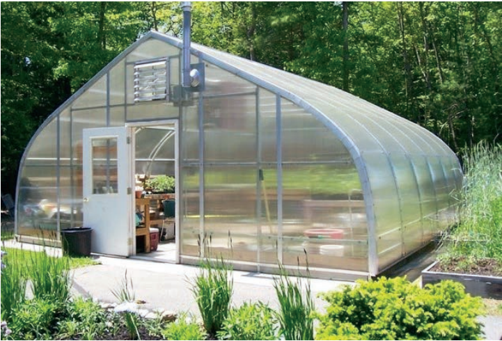
We have chosen this educational greenhouse by Rimol Systems

work tables. We look forward to working in a warm, sunny and sheltered spot during the cold months, to growing greens for our winter meals, and to starting plants early for a jump on the spring. Joy!