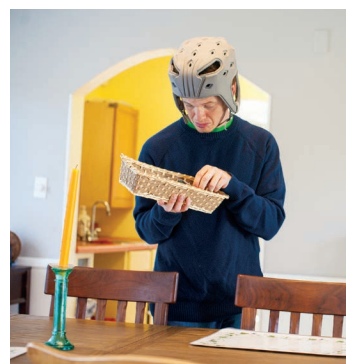
Will setting the table